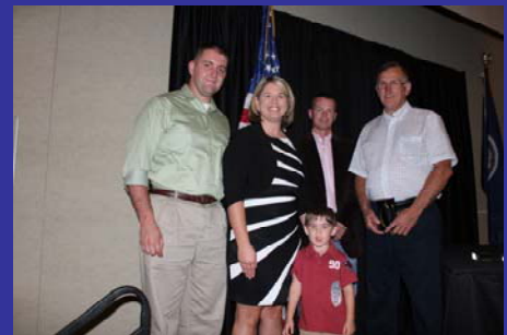
Dante Rescue Squad